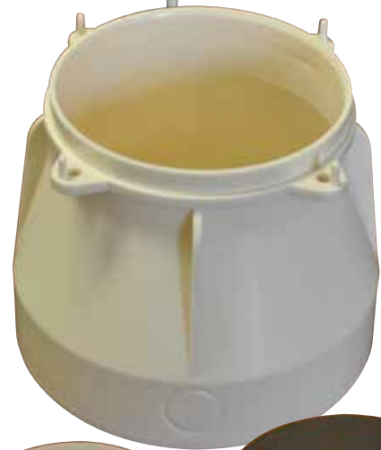
Optional reducer APE RED92-78